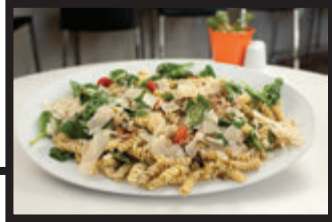
VAULT PASTA //