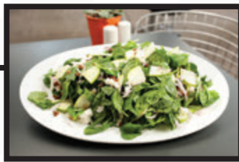
SPINACH SALAD //