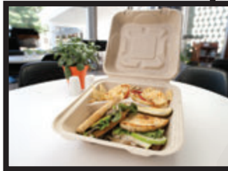
BLT SANDWICH //