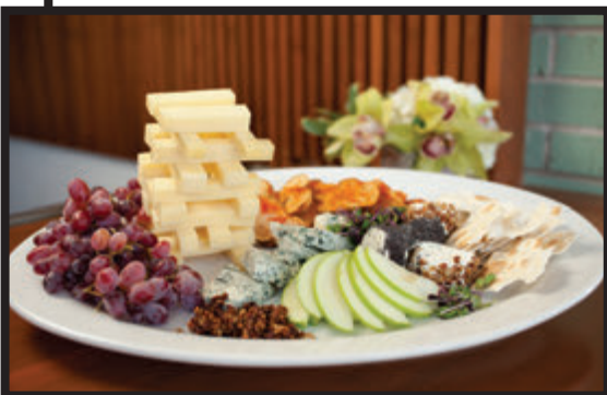
GOURMET CHEESE & FRUIT PLATTER //