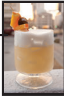
WHISKEY SOUR //