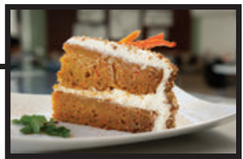
CARROT CAKE //